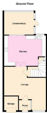
This floorplan is a guide to the layout of the property and should not be used as a measurement tool. Plan produced using PlanUp.